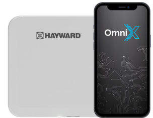
OmniX Gateway sold separately, mobile phone not included.