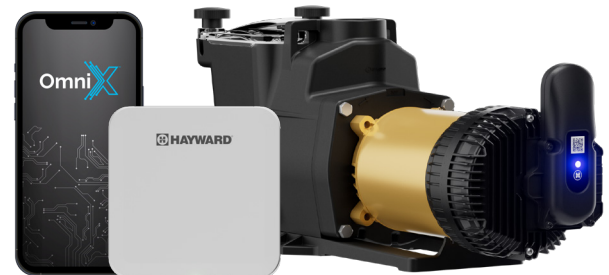
OmniX Gateway Sold Separately