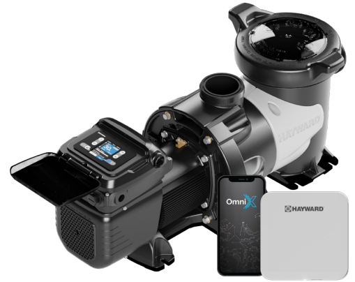
OmniX Gateway sold separately, mobile phone not included.