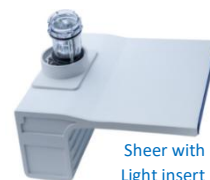
Sheer with Light insert

Illuminated LED Sheers help transform any pool into a sophisticated aquatic escape with mesmerizing water effects in a variety of colors, shapes and designs made to complement any aesthetic.