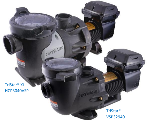
TriStar® XL HCP3040VSP

The integrated Universal Display has an advanced user interface that is designed with usability and flexibility in mind and offers improved user experience and functionality. It seamlessly connects with Omni®, OmniX™ and competitive automation systems.