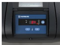
New, clean interface

The small footprint with zero wall clearance fits in even the most