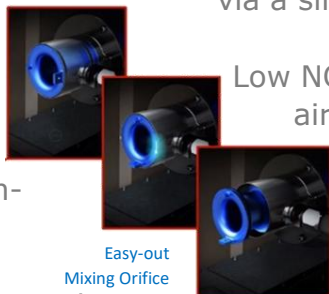
Easy-out Mixing Orifice

The dual-fuel technology gas heater has an Easy-out mixing orifice that allows for easy in-field conversion between natural gas and propane and is uniquely